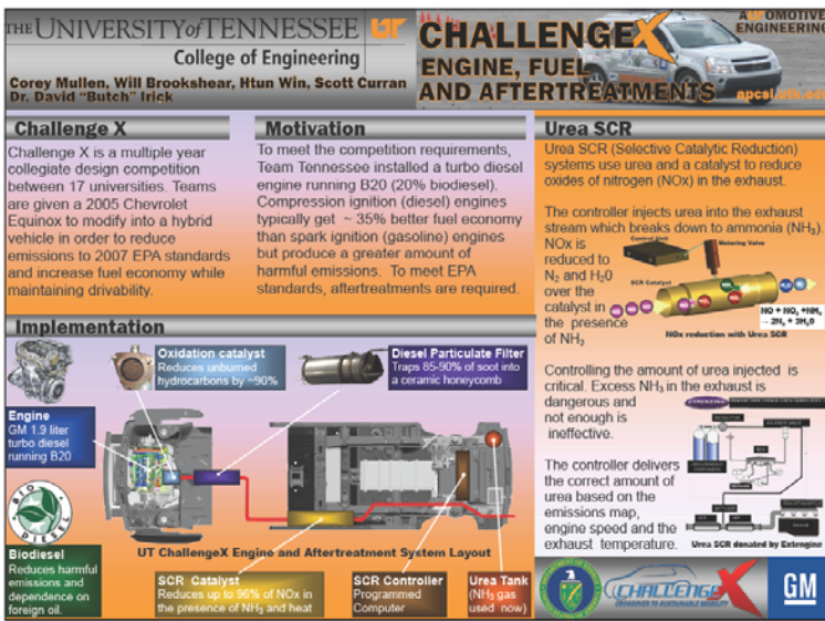
Engine, Fuel and Aftreatment poster

The team was also awarded ChallengeX outreach funding for two posters for the engine and Aftreatments and another for hybrid and controls. The team will print another poster for the NVH/ 99% buyoff achievements.